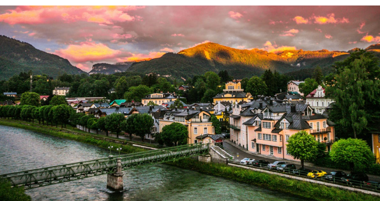
Bad Ischl, Salzammergut

The final stop on your tour along Austria's Romantic Road, which should take you about 8 days in total, is Vienna . The capital of Austria is bubbling with temptations. It begins with sweet treats at Demel and ends with an unbelievably charming walk around the gardens of Schönbrunn Palace, the residence of former Emperors.